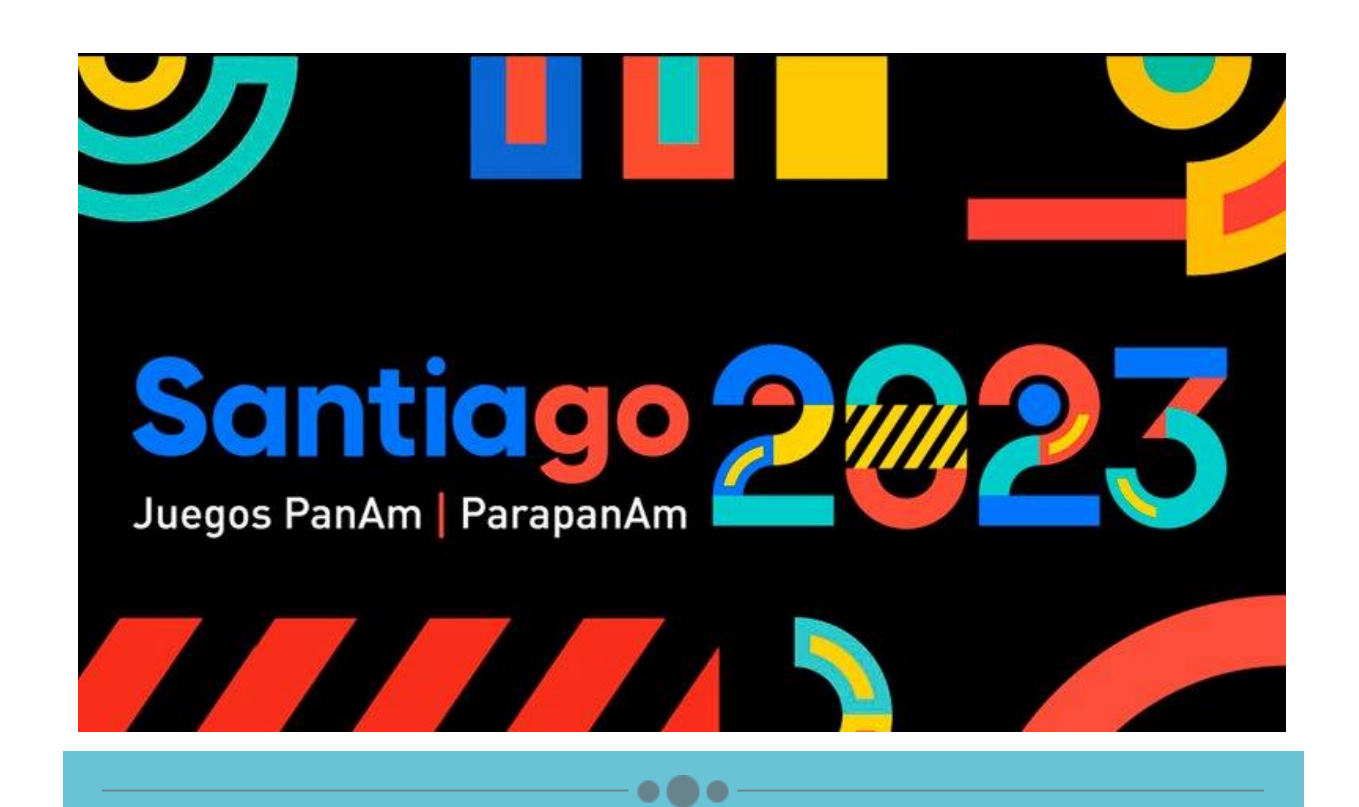
Early Events Show Anyone Can Win in 2023